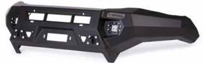
Towing points – Steel 25mm