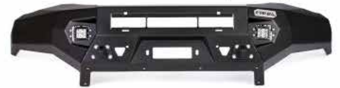
Body – Alloy 6mm