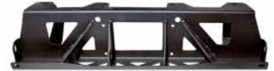
Bracket – Steel 4mm